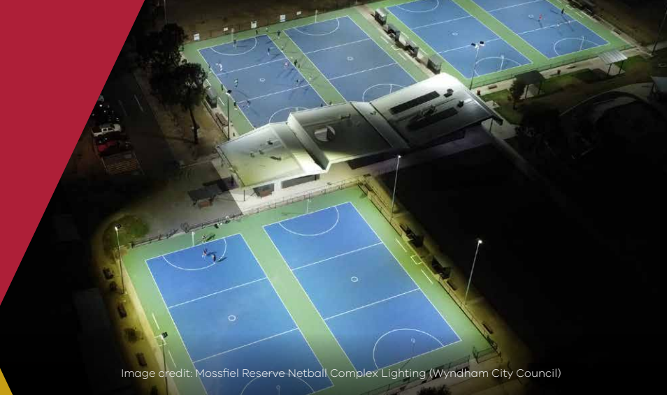
Image credit: Mossfiel Reserve Netball Complex Lighting (Wyndham City Council)