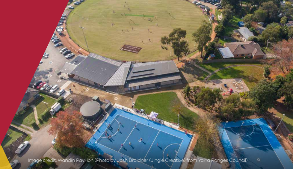
Image credit: Wandin Pavilion (Photo by Josh Braidner (Jingle Creatix) from Yarra Ranges Council)