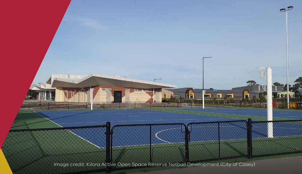
Image credit: Kilora Active Open Space Reserve Netball Development (City of Casey)