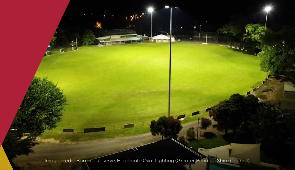
Barrack Reserve, Heathcote Oval Lighting