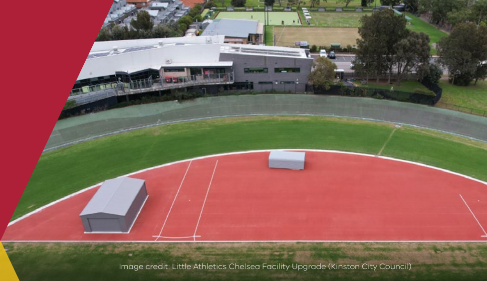
Image credit: Little Athletics Chelsea Facility Upgrade (Kinston City Council)