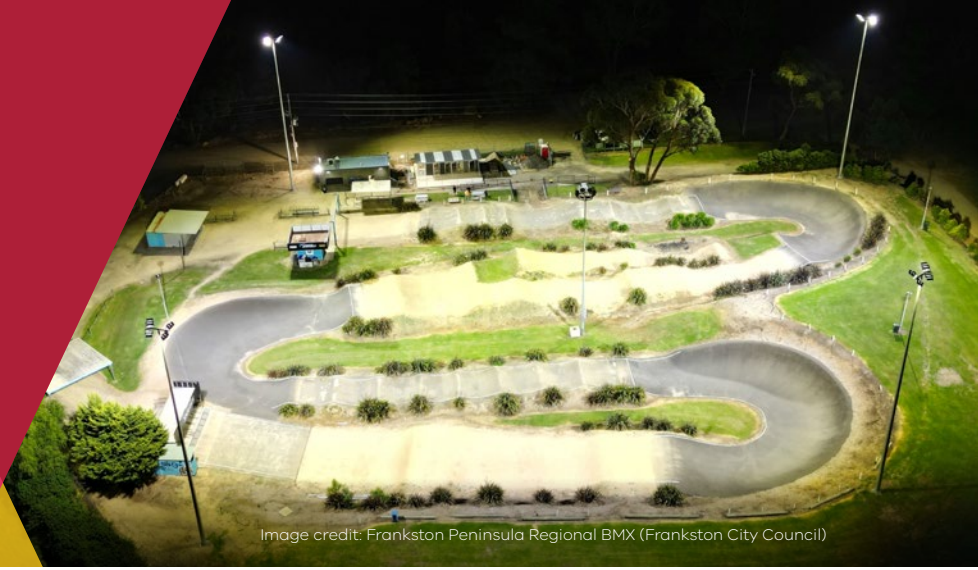
Image credit: Frankston Peninsula Regional BMX (Frankston City Council)