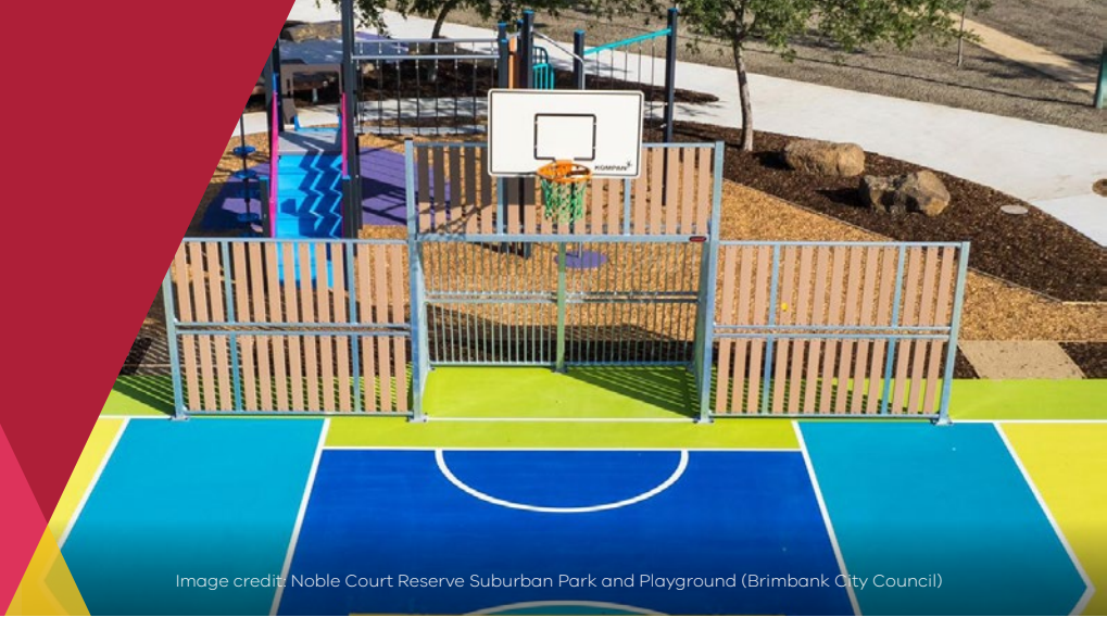
Noble Court Reserve Suburban Park and Playground