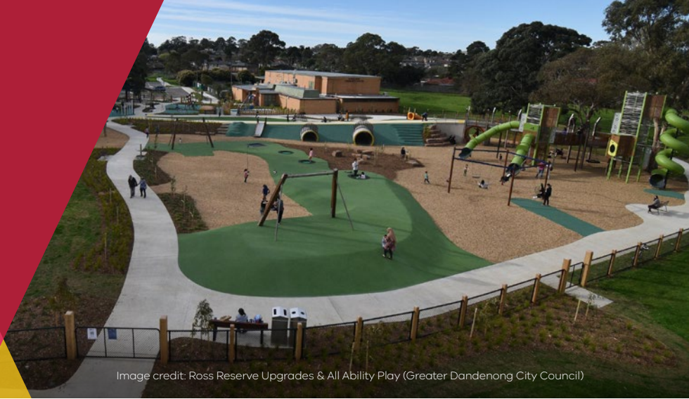
Image credit: Ross Reserve Upgrades & All Ability Play (Greater Dandenong City Council)