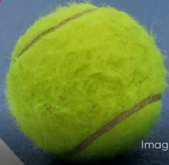
Image credit: Carlson Reserve Multi Sports Court(Monash City Council)