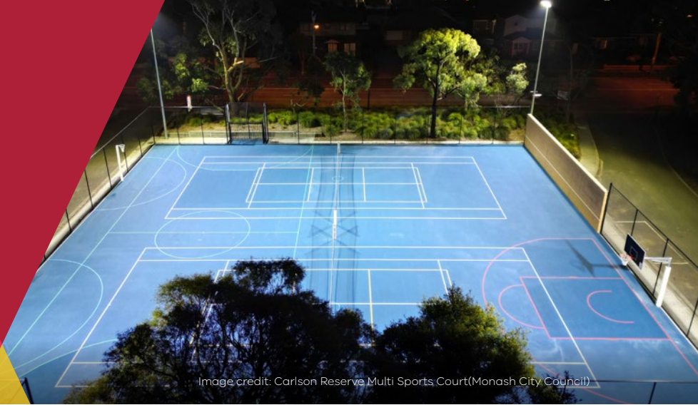
Carlson Reserve Multi Sports Court