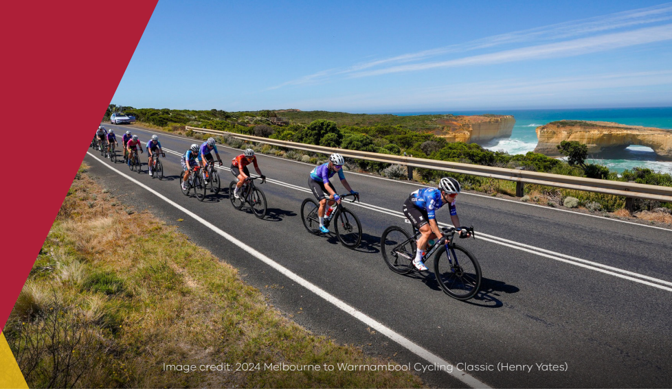
2024 Melbourne to Warrambool Cycling Classic