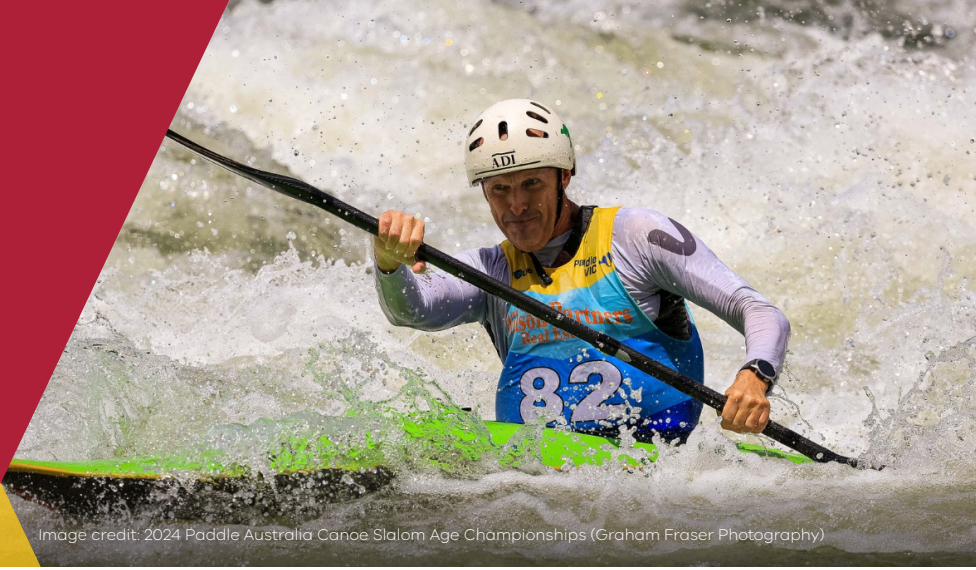
Image credit: 2024 Paddle Australia Canoe Slalom Age Championships (Graham Fraser Photography)