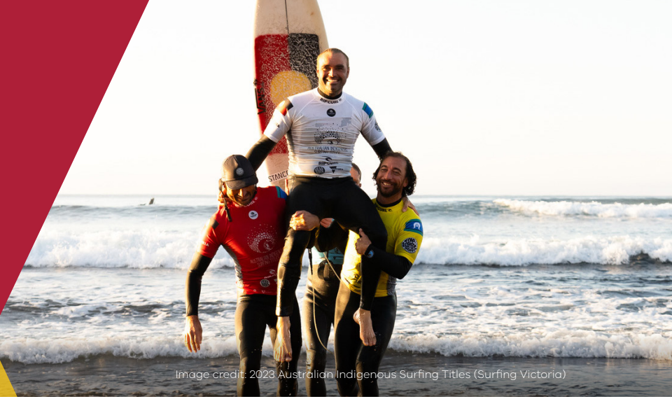
Image credit: 2023 Australian Indigenous Surfing Titles (Surfing Victoria)