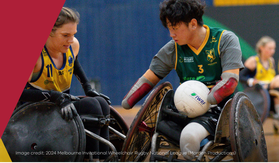
Image credit: 2024 Melbourne Invitational Wheelchair Rugby National League (Morden Productions)