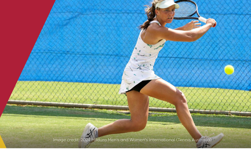
Image credit: 2024 Mildura Men's and Women's International (Tennis Australia)