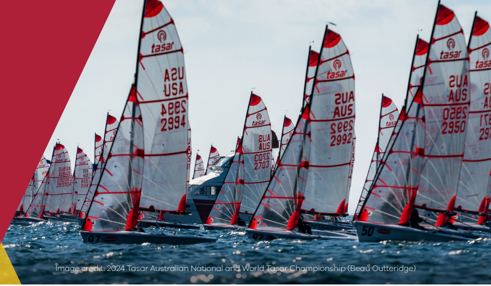
Image credit: 2024 Tasar Australian National and World Tasar Championship (Beau Outteridge)