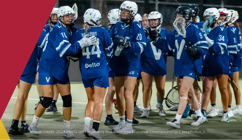
2024 Men's and Women's Box Lacrosse National Championship