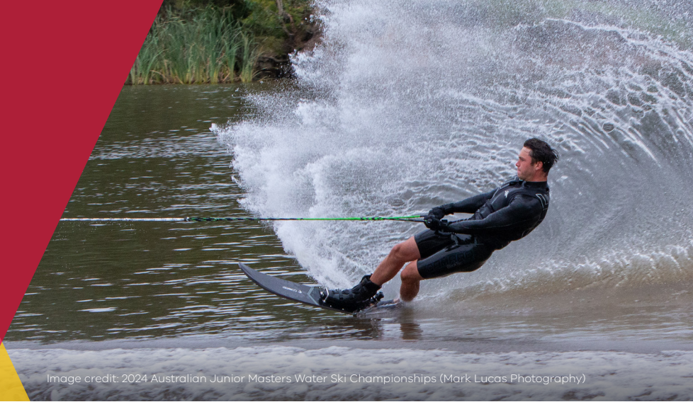
Image credit: 2024 Australian Junior Masters Water Ski Championships (Mark Lucas Photography)