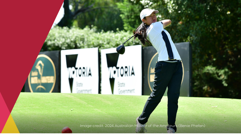
Image credit: 2024 Australian Master of the Amateurs (Benie Phelan)